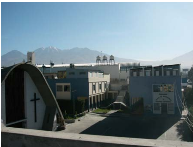
Standing on the roof of the friary of Madre de Misericordia in Arequipa, one can see the parish on the left and the parish center straight ahead.