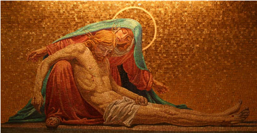
A beautiful mosaic at St. Francis Parish in Milwaukee.