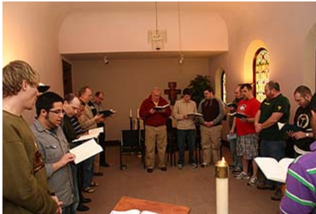
Saturday Morning Prayer at St. Conrad Friary