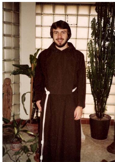
Novitiate 1983. How time flies!

Sometimes a mere “yes” can help us to further discern our vocation in life. When we consent and leave the rest in the hands of God as the early disciples did, we will discover the best way to live out our dreams.