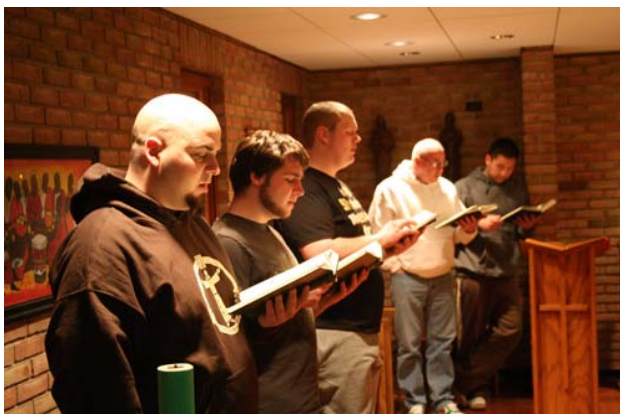
One of the night prayer gatherings.

Most High, Glorious God, enlighten the darkness of my heart and give me true faith, certain hope, and perfect charity, sense and knowledge, Lord, that I may carry out Your holy and true command.