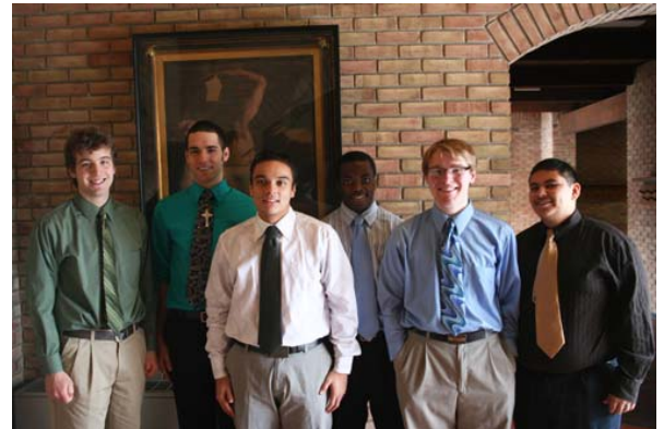
A group of seniors at St. Lawrence who are thinking of becoming Capuchin candidates.