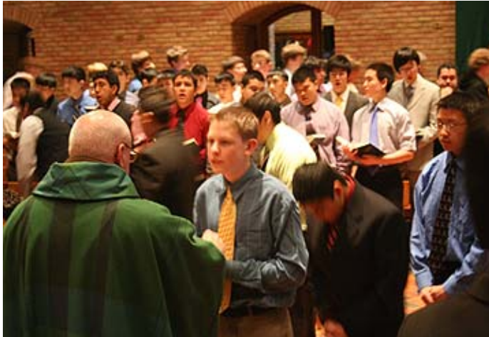
Sunday Mass with the students of St. Lawrence Seminary