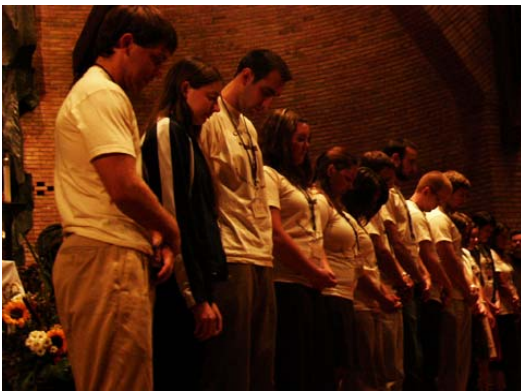
Cap Corps Volunteers